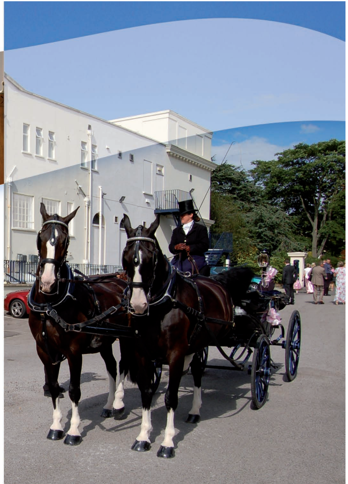
Above: The Elizabethan Suite has direct access to the car park.