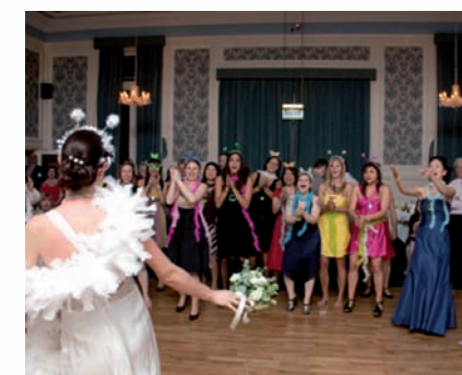
Above: Celebrations continue into the evening. Who will be next?