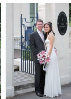
Main picture, far left: Glenmore's unique Mozart Gate awaits your arrival.