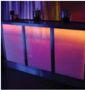
Bar & DJ Booths

Furniture is a must have for most events, as your guests will need to have a place to relax and sit down comfortably. Whether you are looking for indoor, outdoor, illuminated furniture or even themed furniture we have everything you need to make sure your wedding is a great success. We can even tailor most of our furniture to your own choice of colour mixes and materials, giving your special day that extra bit of uniqueness.