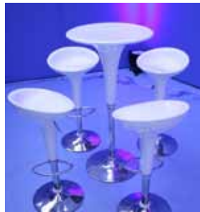
Poseur Tables & Stools