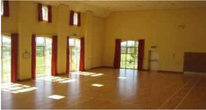
WALTHAM VILLAGE HALL

Take a look at the pictures below, these show what a little bit of draping, lighting, props and décor can do to a bland venue. As you can see, each and every outcome is different, there are so many possibilities that we can achieve for your big day!