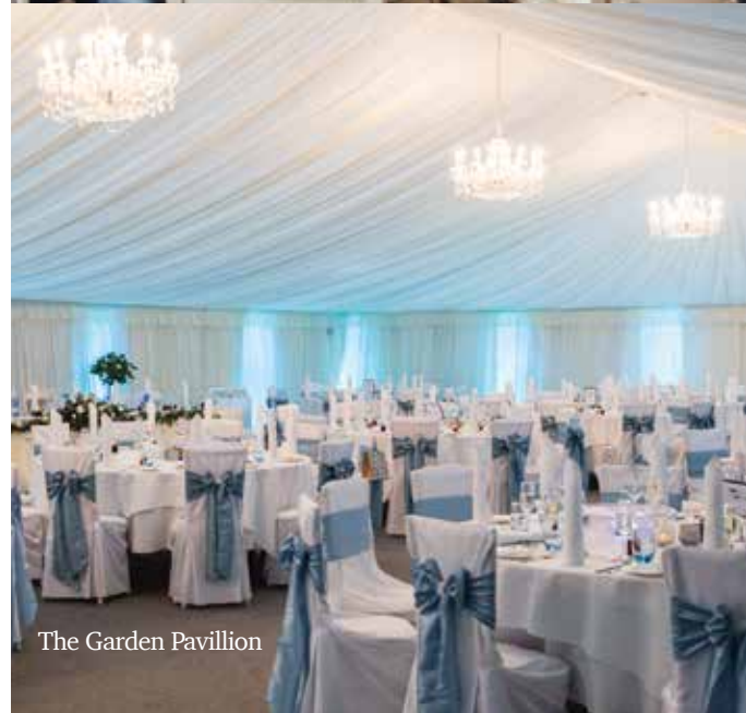
The Garden Pavillion