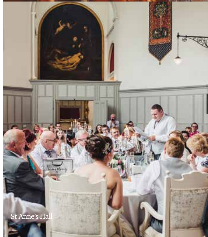
St Anne's Hall