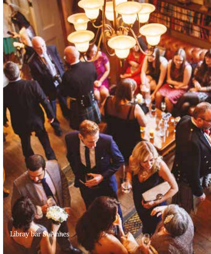
Library bar St Annes

Like any special jewel, once discovered you won't want to share it with anyone else, so how does exclusive-use of the entire Abbey sound to you? Beautifully dressed with luxury touches added throughout by our team of expert wedding team, prepare to get carried away through a one-of-a-kind experience that will take you into married life.