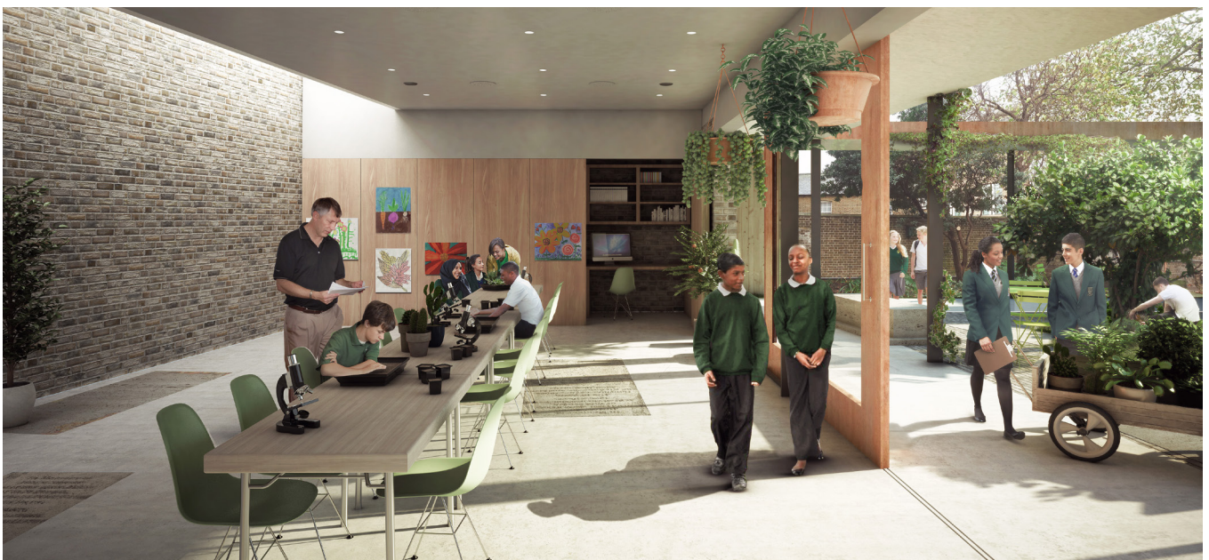
The Garden Classroom

The 2008 wooden structure will be extended along the southern aisle of the church to the east while outside, three new bronze pavilions will surround a courtyard garden designed by Dan Pearson. These buildings, two education spaces and a bigger and brighter café, will all open directly into the gardens. The end result of the project will be a space better suited to holding your event with the stunning architecture of the church highlighted in a way that was not possible previously.