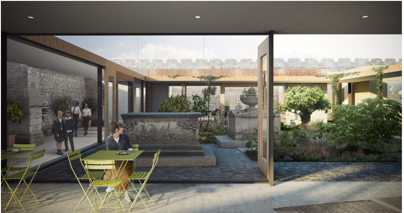
View from cafe to cloister garden

The 2008 wooden structure will be extended along the southern aisle of the church to the east while outside, three new bronze pavilions will surround a courtyard garden designed by Dan Pearson. These buildings, two education spaces and a bigger and brighter café, will all open directly into the gardens. The end result of the project will be a space better suited to holding your event with the stunning architecture of the church highlighted in a way that was not possible previously.